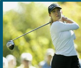
FUTURES Tour Alumnae - Cristie Kerr